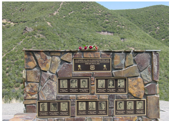
Figure 3: A new memorial was dedicated in July 2005 at the Overlook. The monument portrays the 15 firefighters who died on the Rattlesnake Fire. In the background across the drainage, crosses can be seen at the location where the firefighters were overtaken by the fast moving fire.