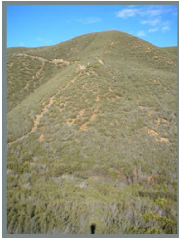
Figure 1: Almost directly across from Stand 3 is the white cross that was placed in 1993 near the spot that the majority of the firefighters were overtaken by the fire.

Click to hear an excerpt from New Tribes Mission Crew Boss Paul Turner's interview. (Requires a media player capable of playing MP3 audio. Click here to download the free Windows Media Player.)