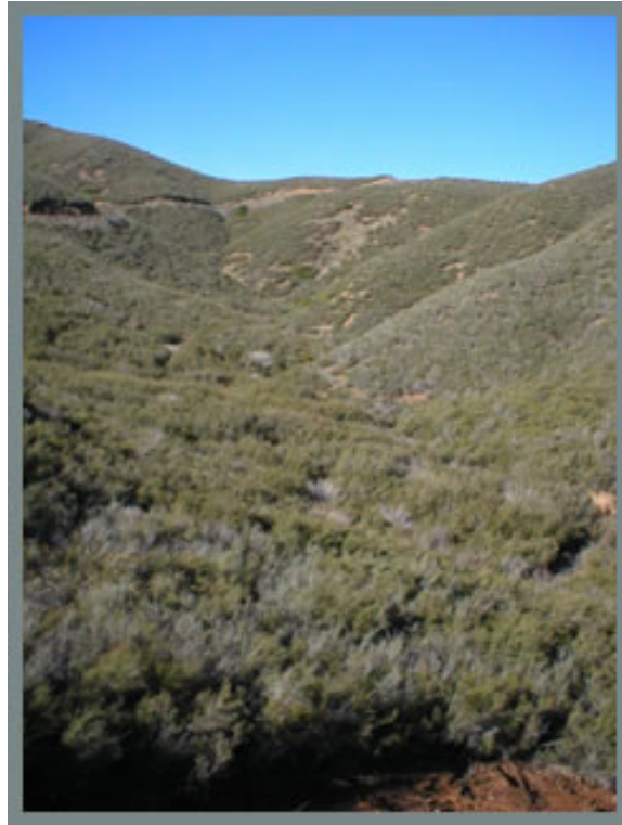
Figure 2: Looking west from this location you can see the head of Powder House Canyon..